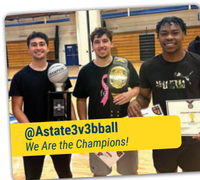
@Astate3v3bball We Are the Champions!