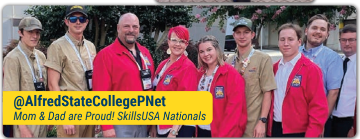
@AlfredStateCollegePNet Mom & Dad are Proud! SkillsUSA Nationals