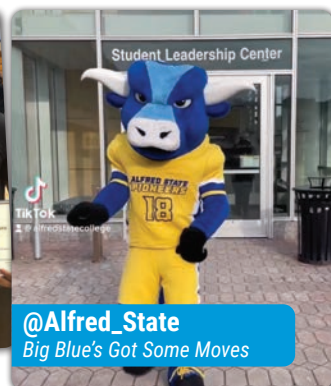
@Alfred_State Big Blue's Got Some Moves