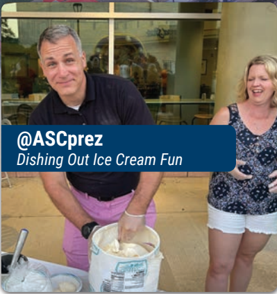
@ASCprez Dishing Out Ice Cream Fun