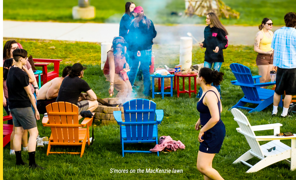
S'mores on the MacKenzie lawn

Log into my.alfredstate.edu and select the Housing & Dining Services card under the "Student Life" category.