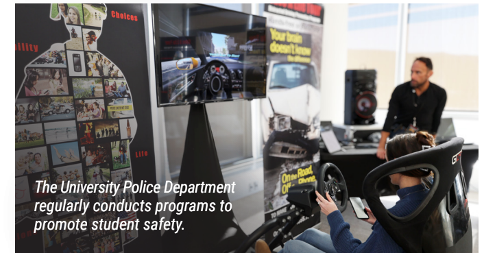
The University Police Department regularly conducts programs to promote student safety.

Each residence hall is supervised by a live-in Residential Professional who is responsible for everything that goes on in that building. Residential Professionals serve as liaisons between students, faculty, parents, and college administrative personnel.