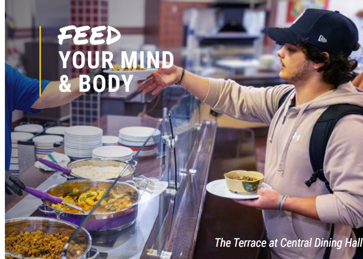
The Terrace at Central Dining Hall