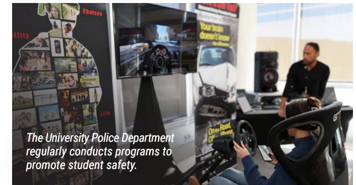
The University Police Department regularly conducts programs to promote student safety.

Each residence hall is supervised by a live-in Residential Professional who is responsible for everything that goes on in that building. Residential Professionals serve as liaisons between students, faculty, parents, and college administrative personnel.