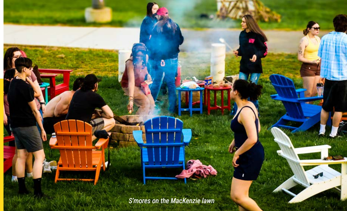
S'mores on the MacKenzie lawn

Log into my.alfredstate.edu and select the Housing & Meal Plan option.